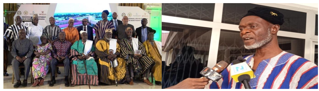
Annex 1: Pictures & Inserts from the Conference